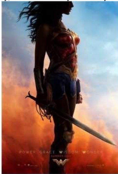
The Wonder Woman 2017 poster

capitalism, where women are nothing but sexualized objects and it's all dudes, all the way down who control everything money, women's autonomy and identity.