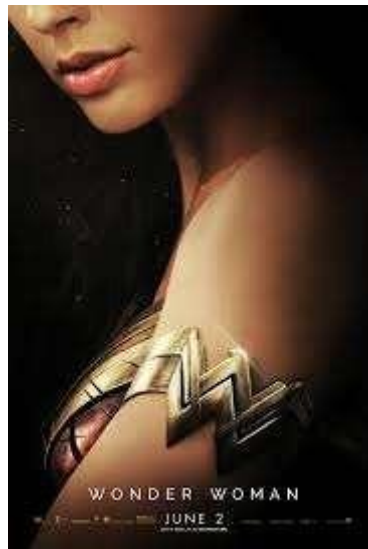
The Wonder Woman poster