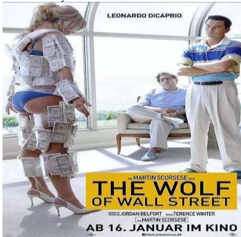
The Wolf of Wall Street poster

The semiotic analysis of the Suicide Squad poster with Harley Quinn employs Peirce's semiotic theory and Goffman's framework to contrast Harley Quinn's sexualization with her rebellious, anarchistic strength. The visual motifs of Harley's outfit, cheeky dress, fishnets, high-heeled boots and a baseball bat serve to sexualize her, but they also intimate her capacity for violence and mayhem. The bat becomes an emblem of both her aggression and strength, already potentially making her more than an object of sexual fantasy, although her body is still the most notable aspect of the image reinforcing her objectification. Goffman's framework helps explain how the dismembering of her figure, the focus on her legs and rear, and the avoidance of her face, strips her down and turns her into a character who exists as a figure for male desire. This, but also the lack of her face and the sexualization of her body, suppress her rebellious side: she becomes a visual object to be pleased rather than a character with unique features. While her weapon suggests power, Harley's sexualization deflates her autonomy, an oppositional visual irony when considering the dynamic between power and objectification. This poster expresses the ambivalence of Harley Quinn's character at once a symbol of defiance and a product of gendered objectification in a way that is believable.