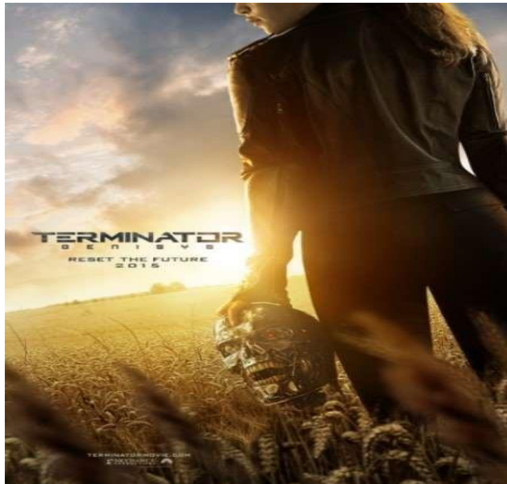
The Terminator: Genisys poster