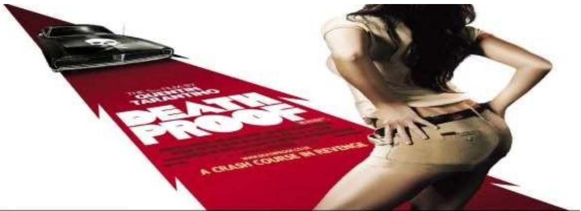
The Death Proof poster

The poster from Death Proof prominently features a woman whose body, especially her hips and rear, is sexualized through her stance and tight clothing, reinforcing her objectification. The background elements, including a car with a skull emblem, symbolize violence and death, key themes of the film. Indexical analysis suggests that the woman's sexualized posture places her in a passive role, while the advancing car signifies imminent danger, amplifying her helplessness. The red background evokes blood and violence, emphasizing the film's danger. Using Goffman's framework, the poster fragments the woman's body, obscuring her face and upper torso to erase her agency and reduce her to a mere object of desire. This ritualization of subordination positions her as a passive target for male aggression. The absence of her face in line with licensed withdrawal further detaches her from any personal agency, solidifying her role as an object. Ultimately, the poster reflects the exploitation genre's typical portrayal of women as both sexualized and vulnerable, reinforcing gender stereotypes of women as passive victims and objects of male desire.