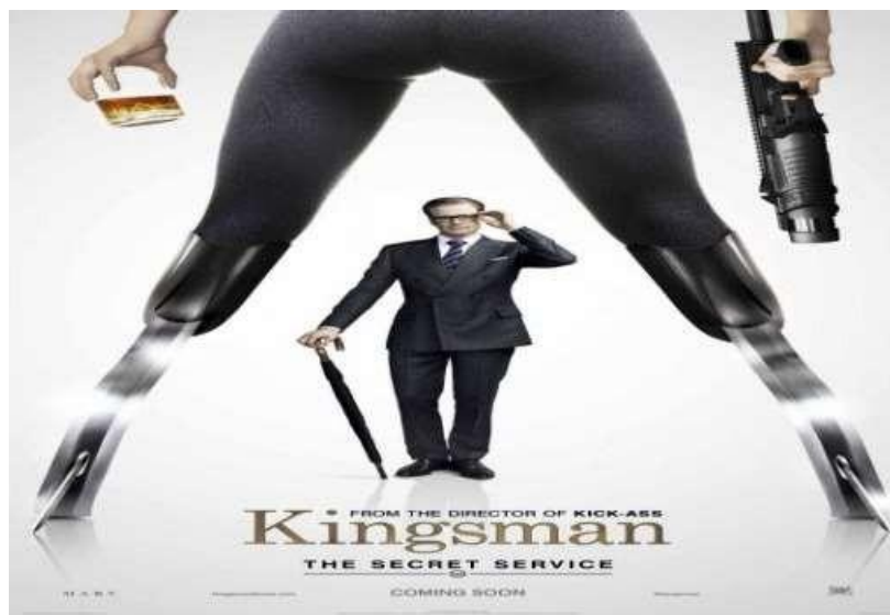
The Kingsman: The Secret Service poster

the lenses of sexualization, fragmentation, and vulnerability in thriller movie posters. The analysis uses Peirce's semiotic theory and Goffman's theory of gender representation to see how women are depicted as both objects of desire and danger through visual elements. Through iconic, indexical and symbolic sign interpretation, the research identifies how women in thriller posters are represented through fragmentation and how it creates a binary between seduction and fragility. These portrayals compound gendered power dynamics by intertwining sensuality and suspense while relegating women to parts that inspire both arousal and trepidation. "Thirsty Women: How Women Fronted Thrillers Exploit Objectification" examines the exploitative ways women are depicted in visual media and how these images reinforce male fantasies about women as seductresses and victims.