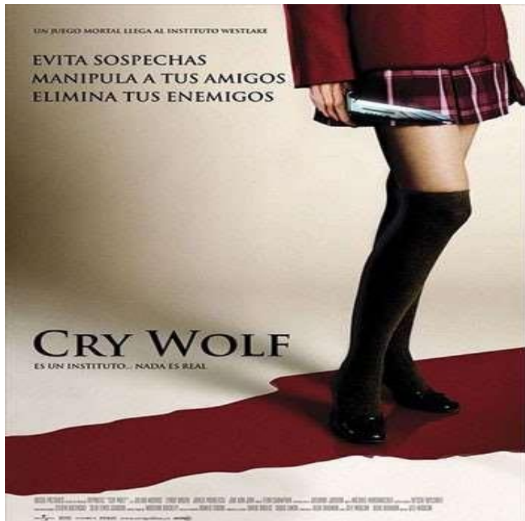
The Cry Wolf poster

Utilizing Peirce's semiotic framework and Goffman's analysis of gender representation, this analysis demonstrates how the female figure in the poster functions as a tension between innocence and danger and objectification and power. The fact that the woman is in a schoolgirl outfit, holding a knife, represents both purity as well as malice, generating an illusive threat in schoolgirls. Goffman's notions of objectification and sexual fragmentation are apparent, as her face and upper torso are obscured, thereby making her a sexual object and stripping her of her personality and agency. This ritualization of subordination is suggested through the focus on her legs and sexualizing her character, with her nevertheless having a weapon. The removal of her face signals psychological severance, making her even more of an object. The poster ultimately wants to combine innocence and danger; the woman seems to be a potential aggressor and a passive sex object, strengthening familiar gender roles in which women are both threats and vulnerable objects.