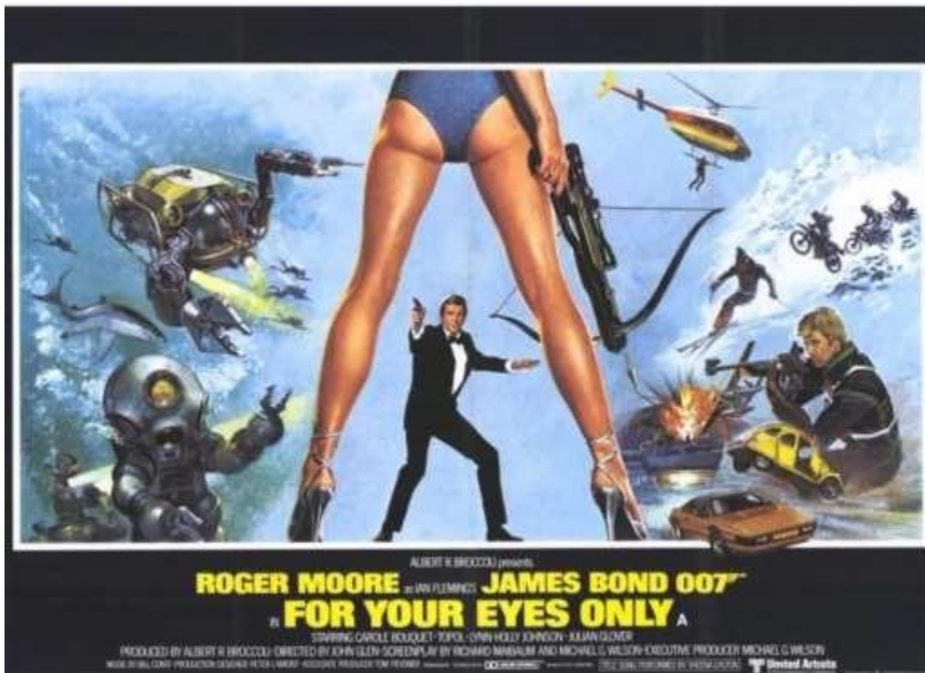
The For Your Eyes Only poster

The poster from Death Proof prominently features a woman whose body, especially her hips and rear, is sexualized through her stance and tight clothing, reinforcing her objectification. The background elements, including a car with a skull emblem, symbolize violence and death, key themes of the film. Indexical analysis suggests that the woman's sexualized posture places her in a passive role, while the advancing car signifies imminent danger, amplifying her helplessness. The red background evokes blood and violence, emphasizing the film's danger. Using Goffman's framework, the poster fragments the woman's body, obscuring her face and upper torso to erase her agency and reduce her to a mere object of desire. This ritualization of subordination positions her as a passive target for male aggression. The absence of her face in line with licensed withdrawal further detaches her from any personal agency, solidifying her role as an object. Ultimately, the poster reflects the exploitation genre's typical portrayal of women as both sexualized and vulnerable, reinforcing gender stereotypes of women as passive victims and objects of male desire.